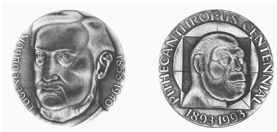
Fig. 7. Medal struck on the occasion of the centenary of the discovery of Homo erectus (Dubois, 1892) showing the portrait of Professor M. Eugène F.Th. Dubois (1858-1940).