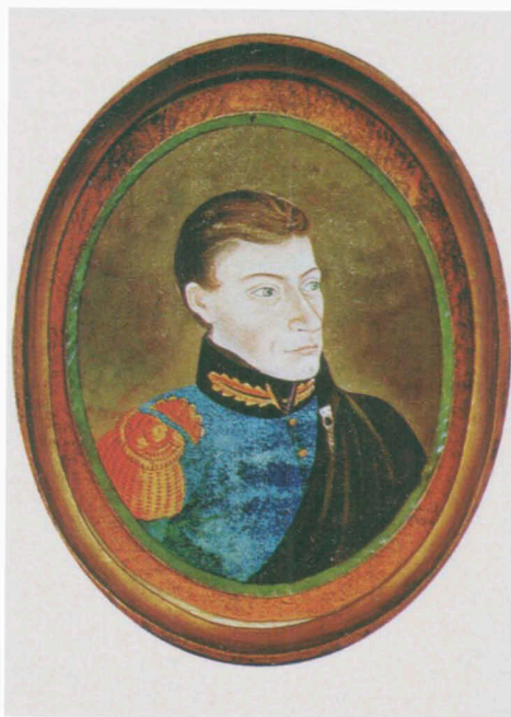
Fig. 5. Japanese painting of Dr. Philipp Franz Balthasar [von] Siebold (1796-1866), first investigator of the geology of Japan.