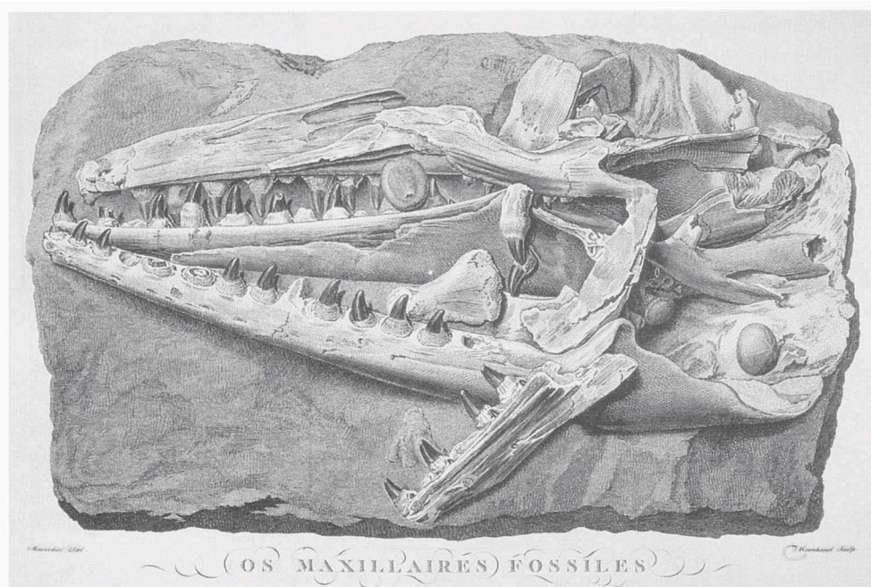
Fig. 2. Replica of mosasaur skull, original in the Muséum National d'Histoire Naturelle at Paris (Faujas-Saint-Fond, 1799, pl. 51).