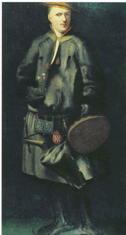
Fig. 1. Painting of Carolus Linnaeus (Carl von Linné; 1707-1778) in Lap costume, physician and famous naturalist, founder of binary systematics (in possession of the Nationaal Natuurhistorisch Museum, Leiden).